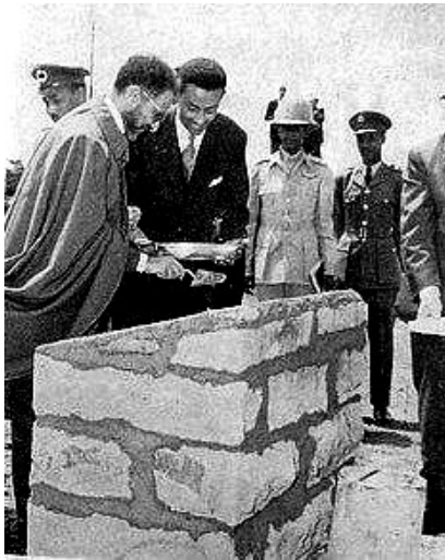
Upon laying the Cornerstone of The Arts Building...

Education develops the intellect; and the intellect distinguishes man from other creatures. It is education that enables man to harness nature and utilize her resources for the well-being and improvement of his life. The key for the betterment and completeness of modern living is education. But, "Man cannot live by bread alone." Man, after all, is also composed of intellect and soul. Therefore, education in general, and higher education in particular, must aim to provide, beyond the physical, food for the intellect and soul. That education which ignores man's intrinsic nature, and neglects his intellect and reasoning power can not be considered true education.