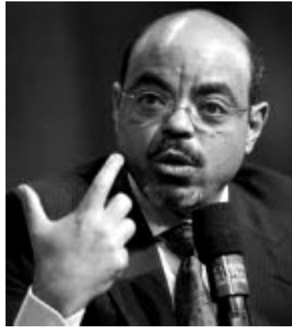
P.M. Meles Zenawi

Wikileaks Ethiopia Files Recently released Wikileaks Ethiopia files expose how Ethiopian security forces planted 3 bombs that went off in the Ethiopian capital Addis Ababa on September 16, 2006 and then blamed Eritrea and the Oromo resistance for the blasts in a case that raises serious questions about the claims made about the bombing attempt against the African Union summit earlier this year in Addis Ababa, E t h i o p i a .