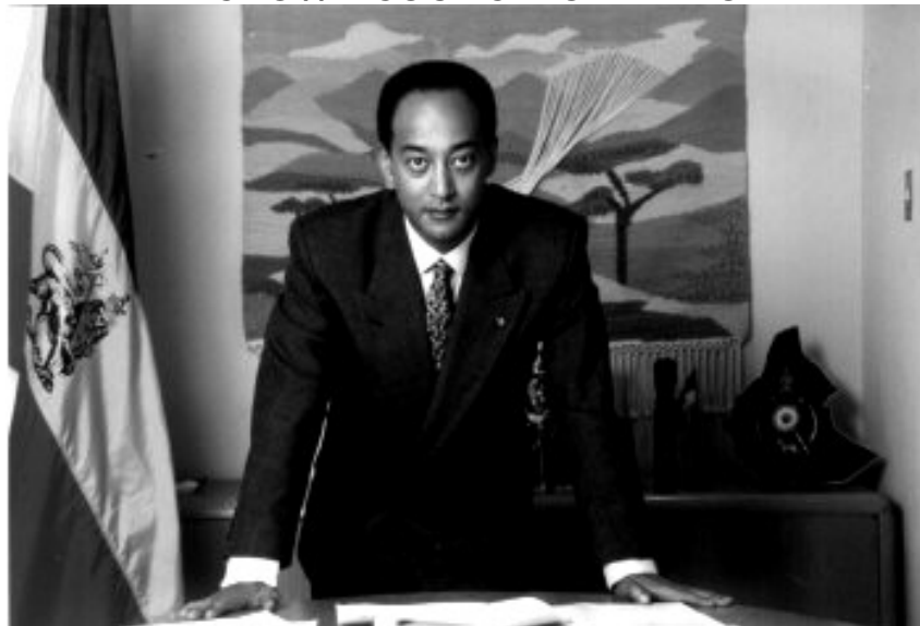
HIH Prince Ermias Sahle-Selassie Haile-Selassie Chairman – The Crown Council of Ethiopia